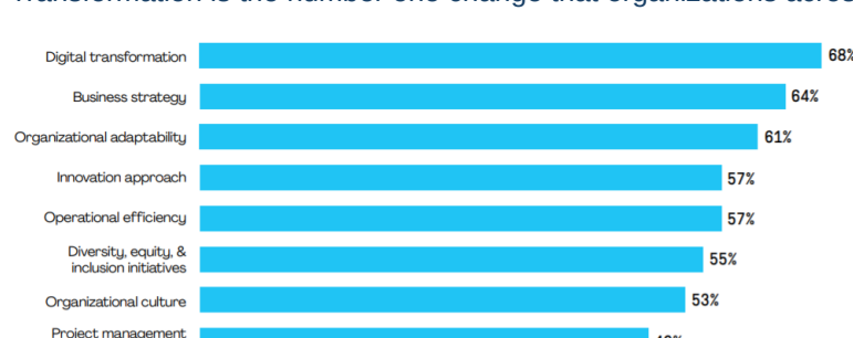
Q: How would you describe the change in your business over the past 12 months compared to the 12 months prior in the following areas? (*Many/Some significant changes shown)

According to PMI's research findings in its Pulse of the Profession 2021 (2021) , Digital Transformation is the number one change that organizations across the globe have focused.