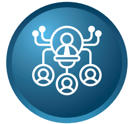
Project Resources Management