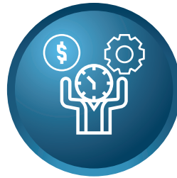
Timesheets & Leave Management