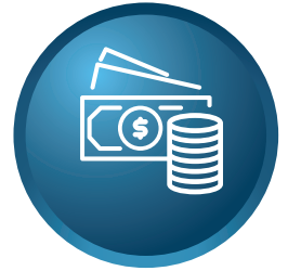
Project Financials Management