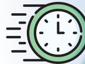
Timesheets & Leave Management