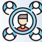
Project Resources Management