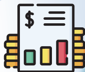
Project Financials Management