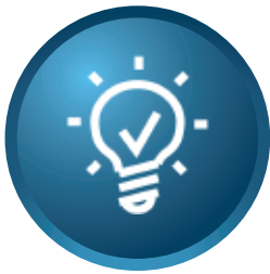
New Product Development