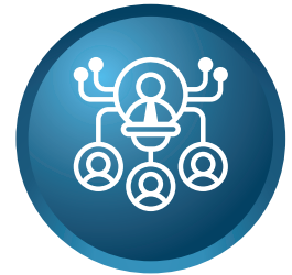
Project Resources Management