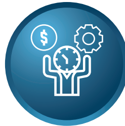
Timesheets & Leave Management