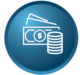
Project Financials Management